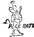
MT. AIRY VHF RADIO CLUB, INC.