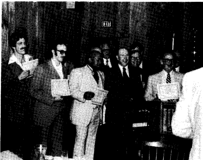
JAN VHF SS ACHIEVMENT CERTIFICATE RECIPIENTS