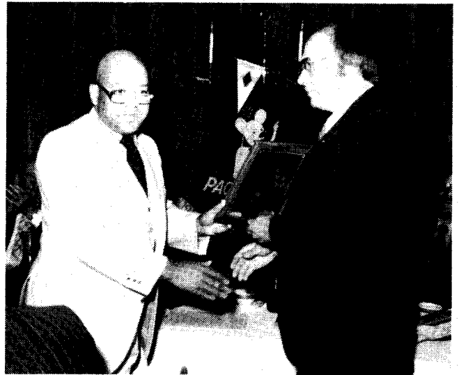
AWARDS CHAIRMAN WA2DPU HONORS THE KING WA3AXV WITH HIS NUMERO UNO PLAQUE