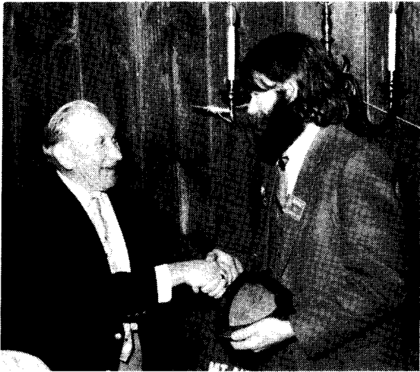
MC W3CL PRESENTS OUR PREZ W3HQT WITH THE PACK RAT OF THE YEAR AWARD